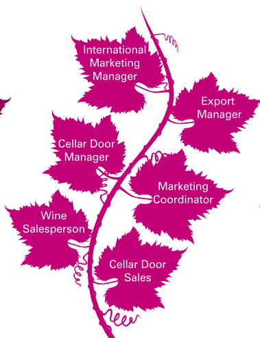
MARKET & SELL